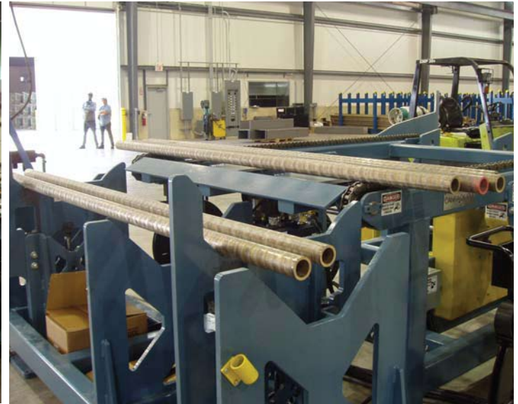
Banding station with impact bars and bundling yokes