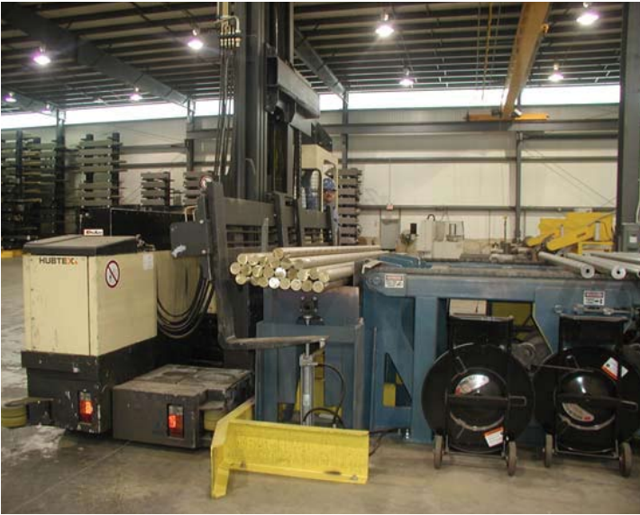
Material picked from pan to load system